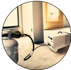
Runs on a single 20 lbs cylinder